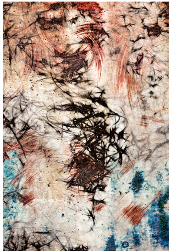
Contrary Classics C.E. Morse (above) Page 37