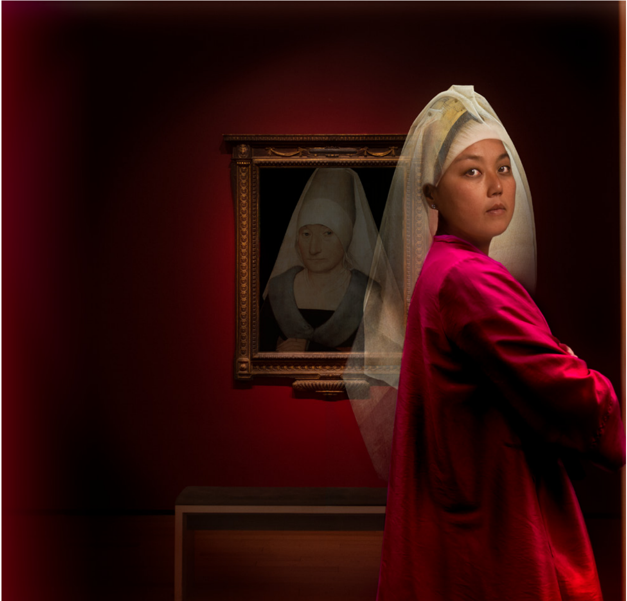
Two Wimples, 2018.

The work presented here span the years from 2008 until 2019. I generally don't work in series, but there is a through-line or a connective tissue in all my work over these many years: my life-long interest in the human figure; the image as visual narrative; the solitary figure attempting and often failing at forging connections and relationships; and that in-between place in which we all reside. My images blur the boundary between truth and illusion, history and the present, memory and fantasy.