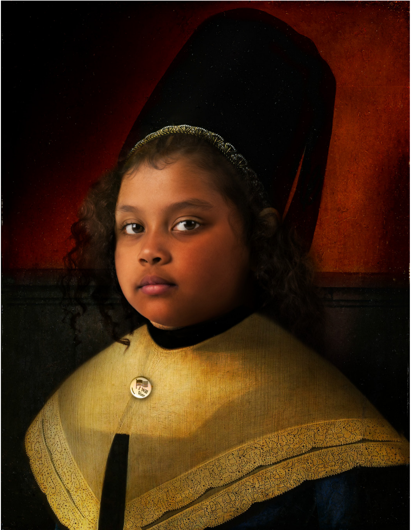
I Will Vote.