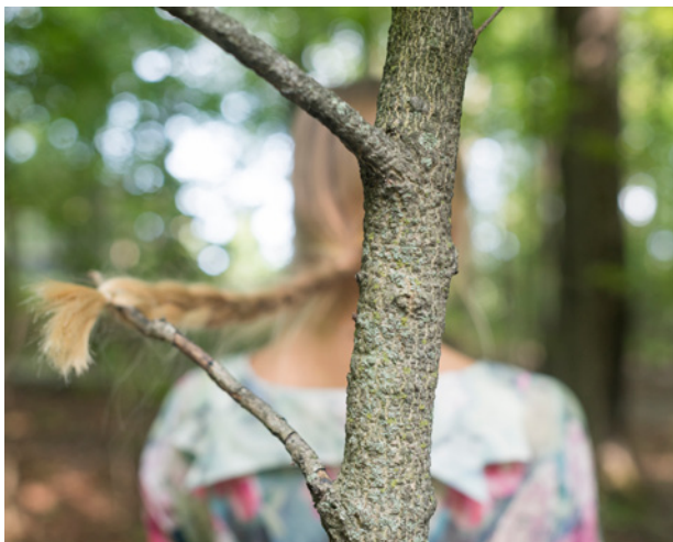
Adaptations Patti Christakos (below) Page 25