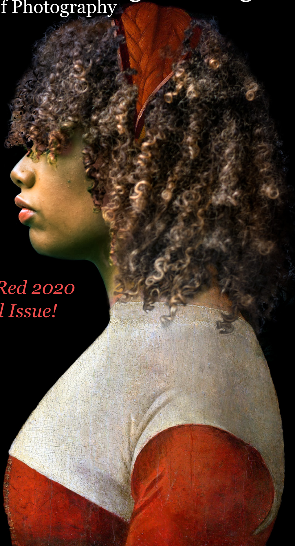
Volume 6/Issue 03 March/April 2020 ISSN: 2471-7881