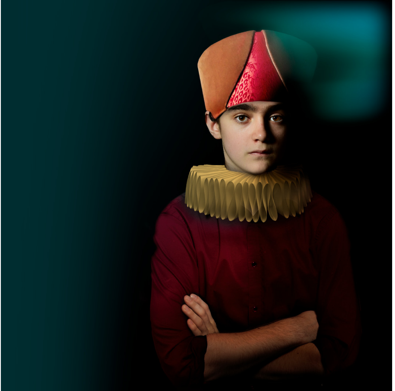
Boy in Red Hat , 2018. ©Fran Forman