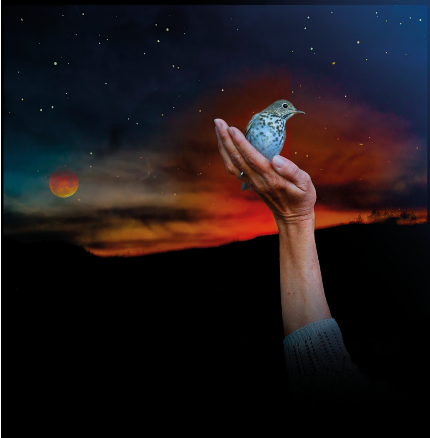
Night Bird.