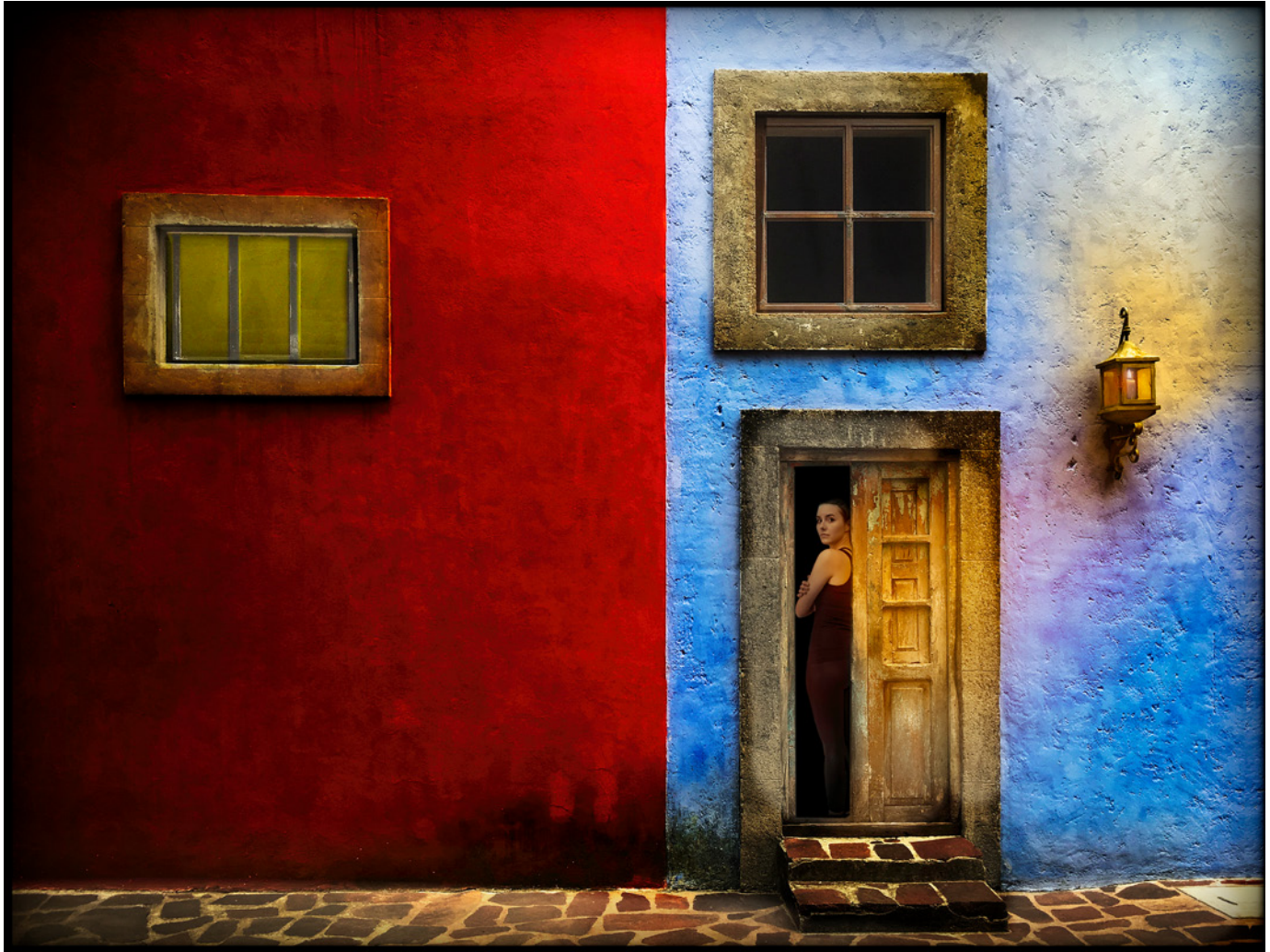
At the Threshold , 2018. ©Fran Forman