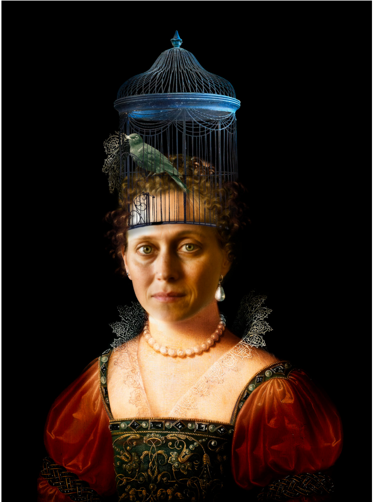
Portrait of a Woman with Birdcage. ©Fran Forman