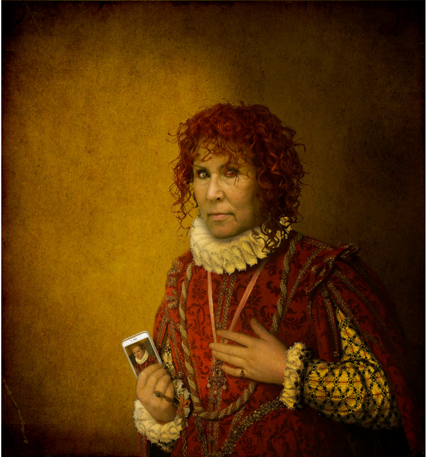
Portrait of a Woman with Selfie.