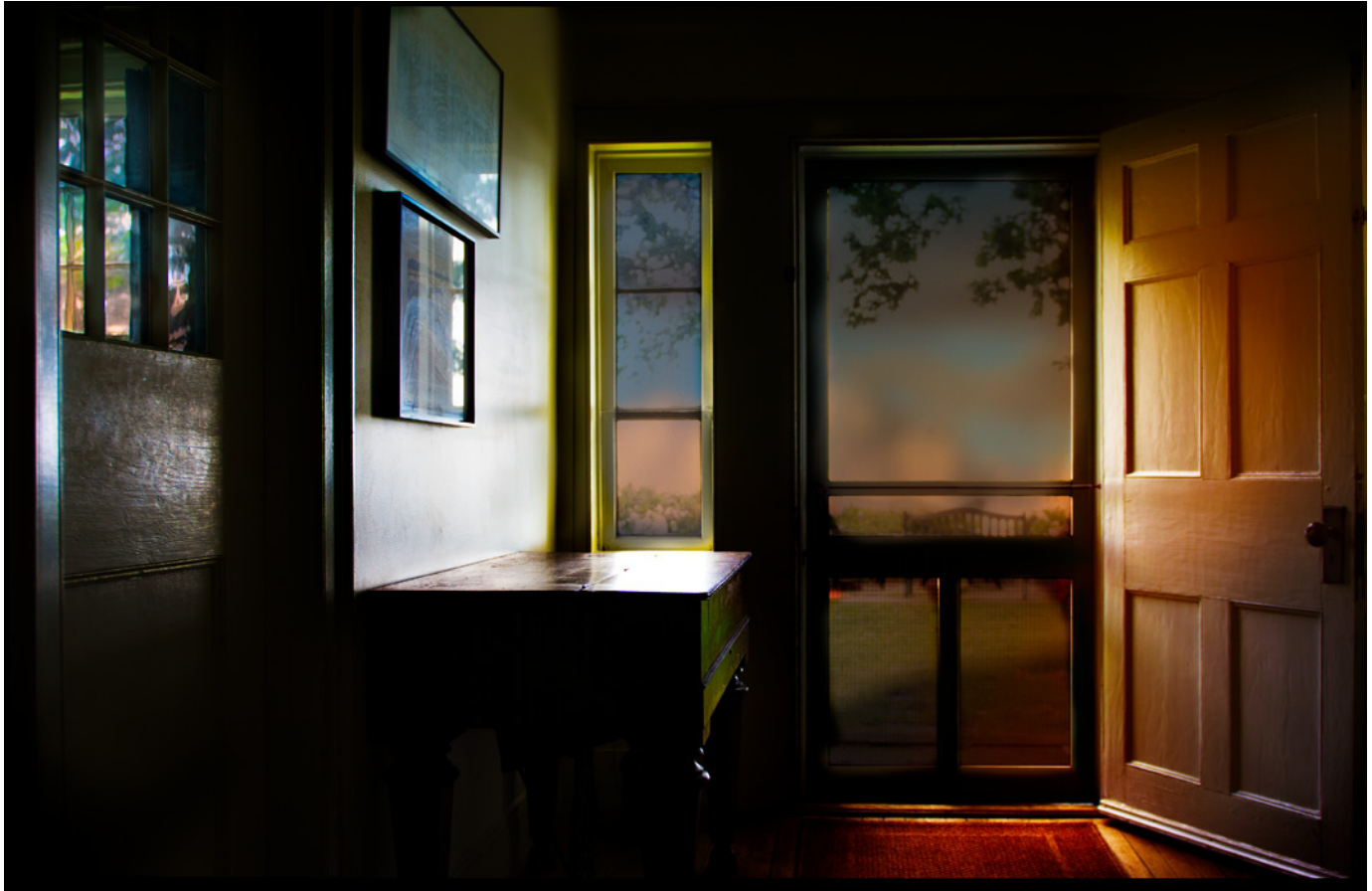
Door to the Sea.