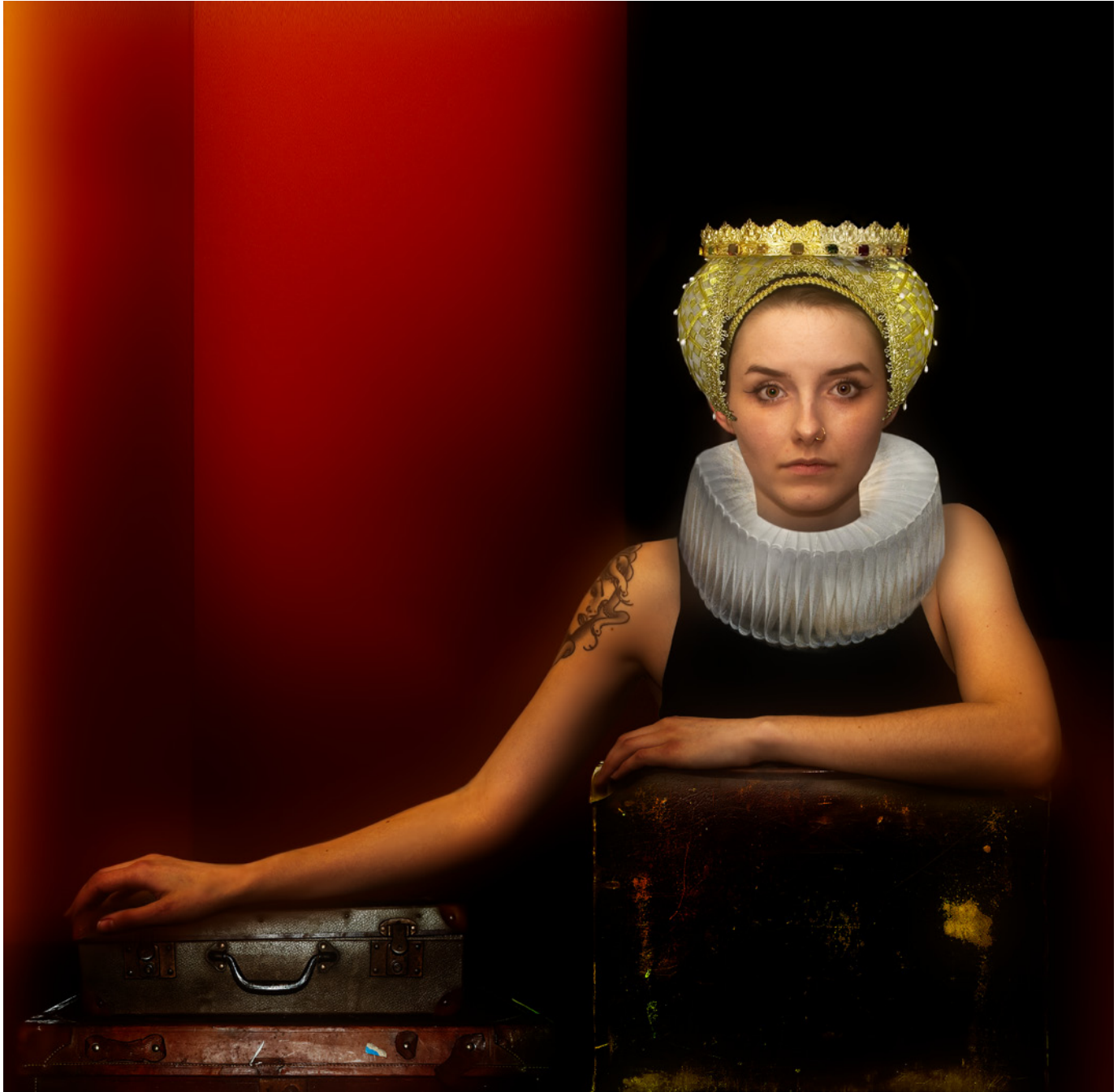
Red Walls and Valise. ©Fran Forman