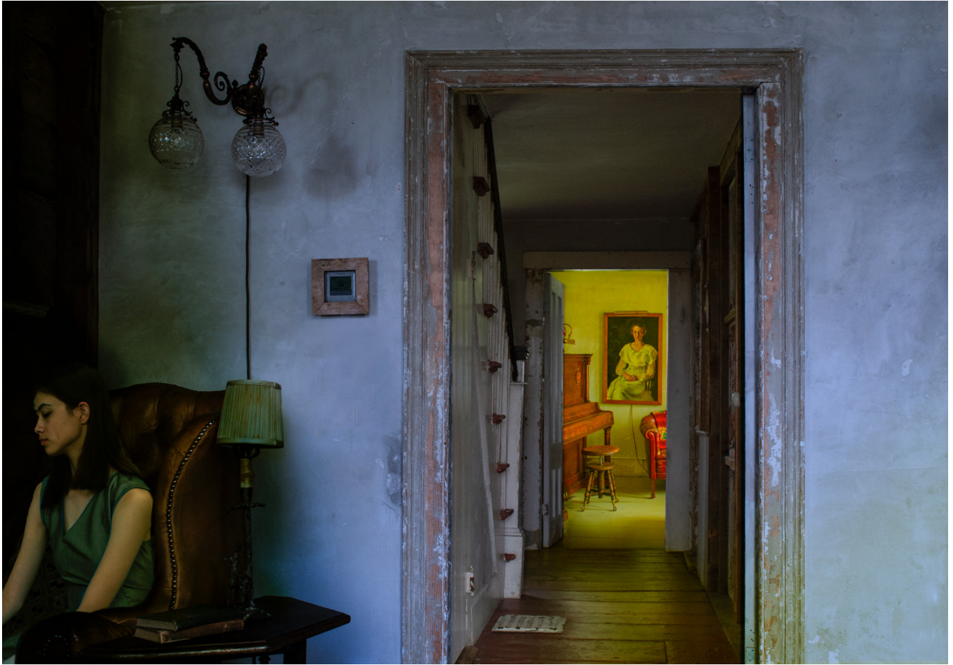
Portrait of a Lady.