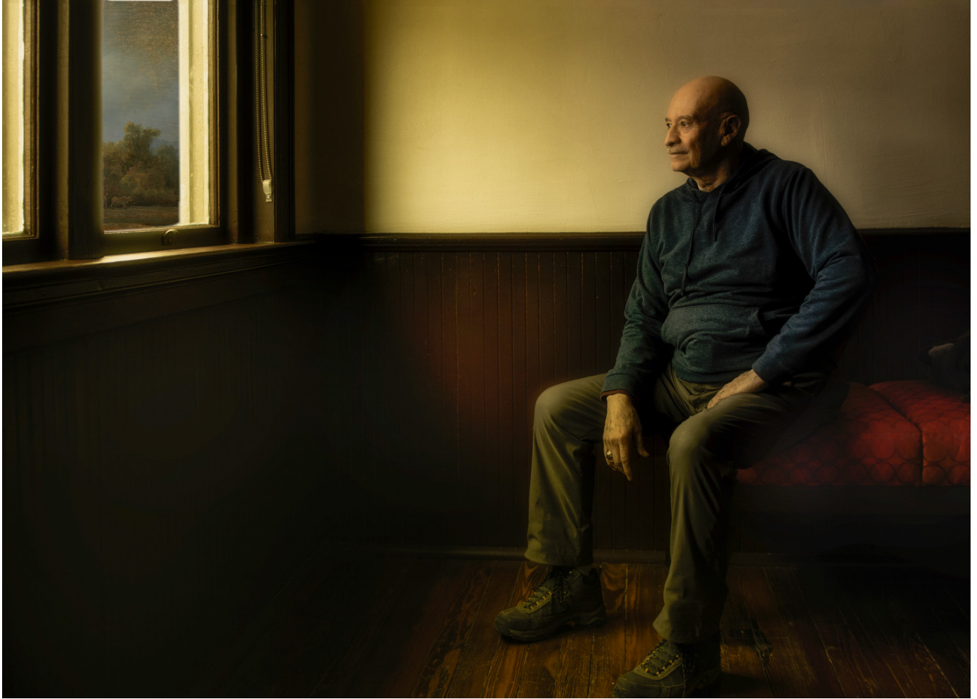
Man in Virginia