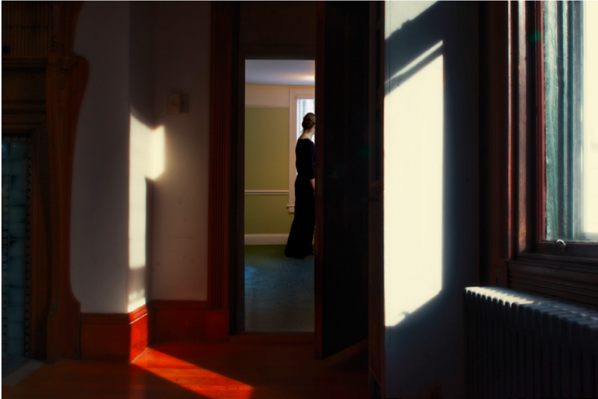
Homage to Hammerschøi

Over the past few years, I have noticed a sense of absence, disconnection, and disquiet permeating my life and those around me. Creating constructed visual narratives allows me to express visually what I cannot articulate with words: How do you describe Absence?