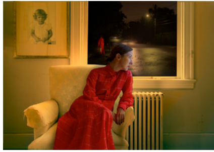
Table of Contents • March/April 2023 • Volume 9/Issue 52