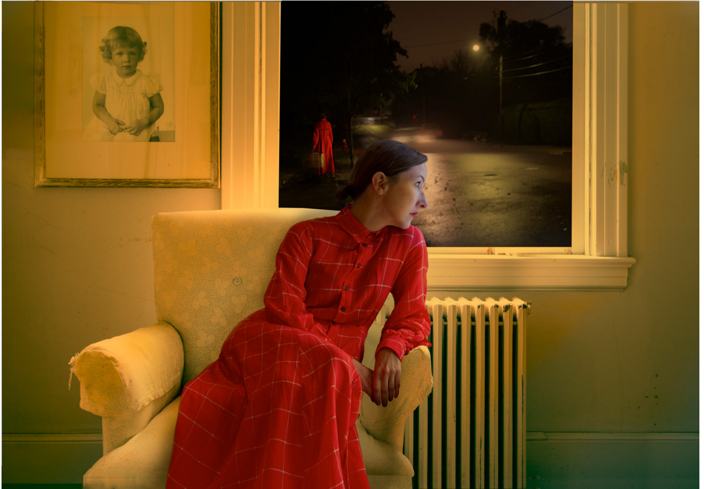
Woman in the Rain.